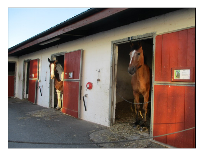
Indie and Jelly enjoy the view from their box stalls at Festina Lente.