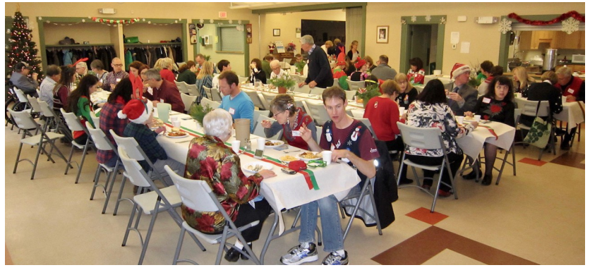
A good time was had by all!

A slightly smaller crowd than usual (perhaps due to the party being held on a Saturday) still pulled out all the stops to have a rollicking good time. The usual spectacular pot-luck meal (thanks to our kitchen volunteers!) "went down" well. Awards and messages of appreciation were joyfully applauded. Door prizes were won. That old favourite, the Pass the Parcel game, was played. And (gasp!) the festivities were interrupted by a message from the Mounties [see side bar below "Three Valuable Raffle Prizes"].