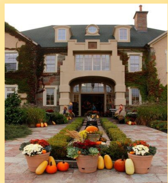
Gingerwood's main entrance.