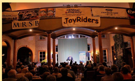
The splendid setting for our fund-raiser.