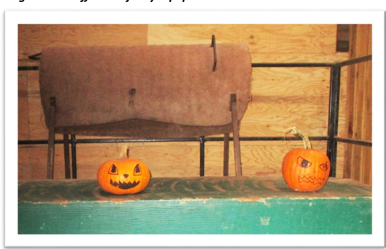
Sorry, guys. Only one pumpkin per horse.