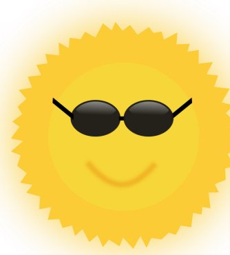
Summer Sizzler Part 1