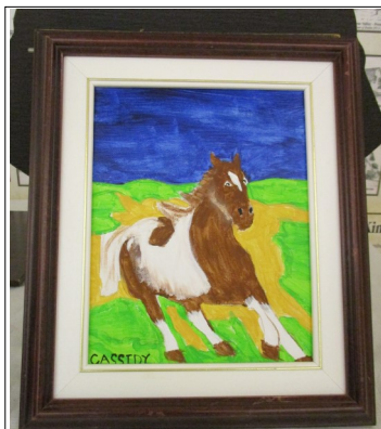
Cassidy's painting of our old therapy pony, Peanuts.