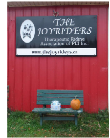
Hallowe'en at the barn.