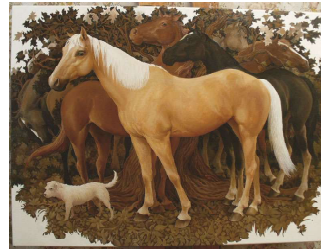
Lindee Climo's beautiful image of therapy horse Tanner, featured on our fund-raising cards.