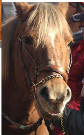
Cue (above) and Syd, two anchor therapy horses. Are they dreaming about the Christmas party?