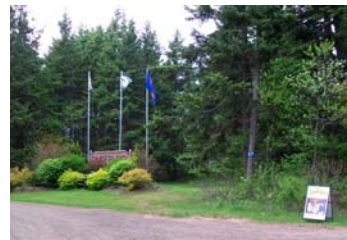
Gingerwood and the Joyriders, partners in presenting the arena sessions, which comprised over half the conference's session time.